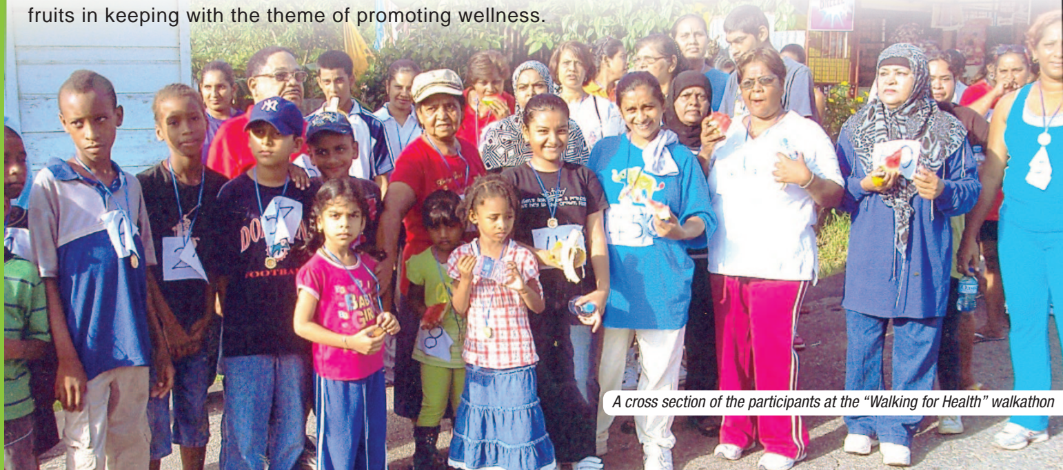
A cross section of the participants at the "Walking for Health" walkathon

The walk started at Mamoral Crossing and proceeded to Flanagin Town Health Centre. As a form of incentive, those who participated were awarded medals and they were presented with hampers and fruits in keeping with the theme of promoting wellness.