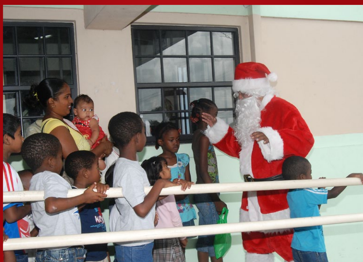
Santa Greets the Children at Ste. Madeline Health Centre on His Arrival