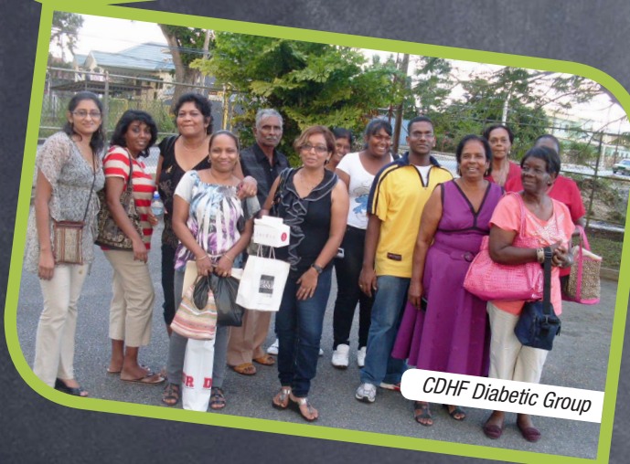
CDHF Diabetic Group