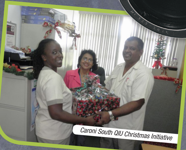
Caroni South QIU Christmas Initiative