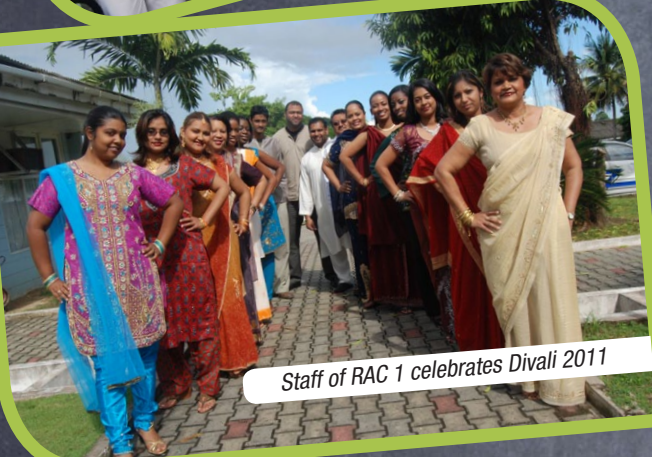
Staff of RAC 1 celebrates Divali 2011