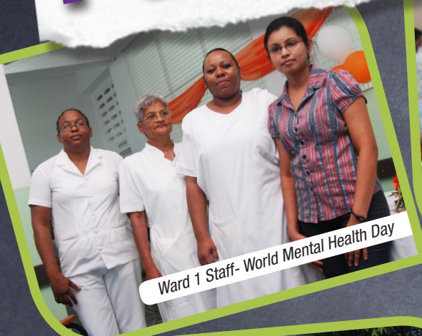
Ward 1 Staff- World Mental Health Day