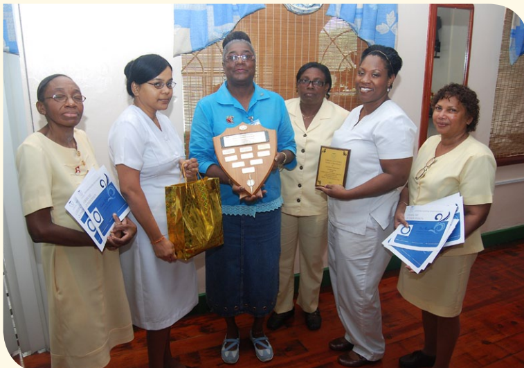
In Photo: Staff of the Out Patients' Clinic with their plaques and certificates