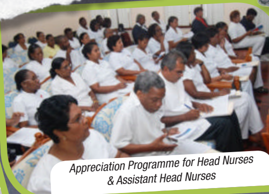
Appreciation Programme for Head Nurses & Assistant Head Nurses